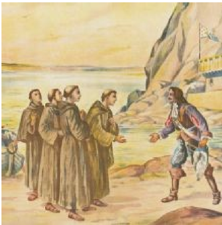
[Arrivée des Récollets à Québec, JUIN 1615]