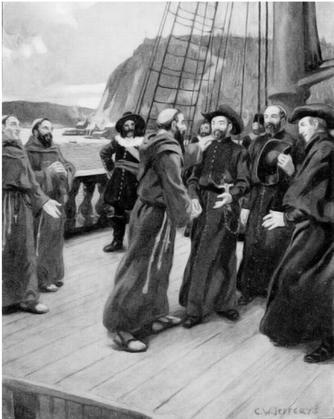
Tableau de C.W. Jefferys, Les Recollets accueillant les Jésuites à Québec en 1625

the Récollet Order about their waist, peaked hood hanging from their shoulders, and coarse wooden sandals on their feet, stood before them on the deck, giving them a wholehearted welcome and offering them a home, with the use of half of the buildings and land on the St. Charles. Right gladly the Jesuits accepted the offer and were rowed ashore in the boat of the generous friars . . .